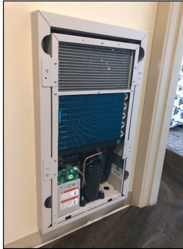
Exterior Sleeve installed with IW25-5 IN Wall base unit and mounting tabs.