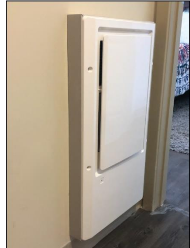
IW25-5 In Wall Dehumidifier installed with Exterior Sleeve and cover.