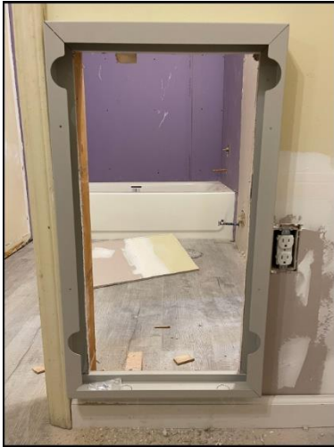
Exterior Sleeve installed with rough opening cut out of 2 x 4 wall.

Exterior Sleeve Dimensions: 17.5" W x 30.5" H x 2.2" D